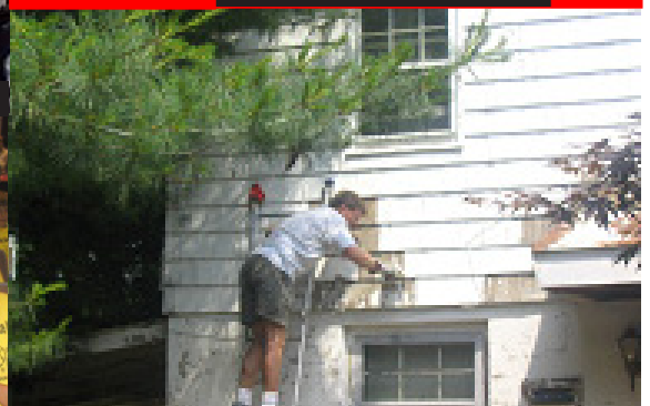
Project Helping Heart