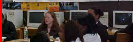
SBHC Book Club