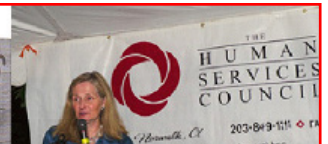
HSC June Gala