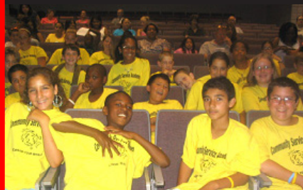
Community Service Academy